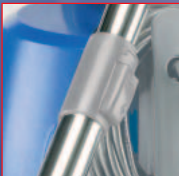
Telescopic Steel Wand