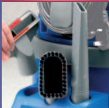
Integral Tool Holder

Super powerful 1000 watt motor for faster cleaning. Feature packed including dust-free triple filtration, telescopic steel wand and castors for easy movement.