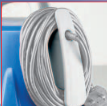
On-board Cable Store